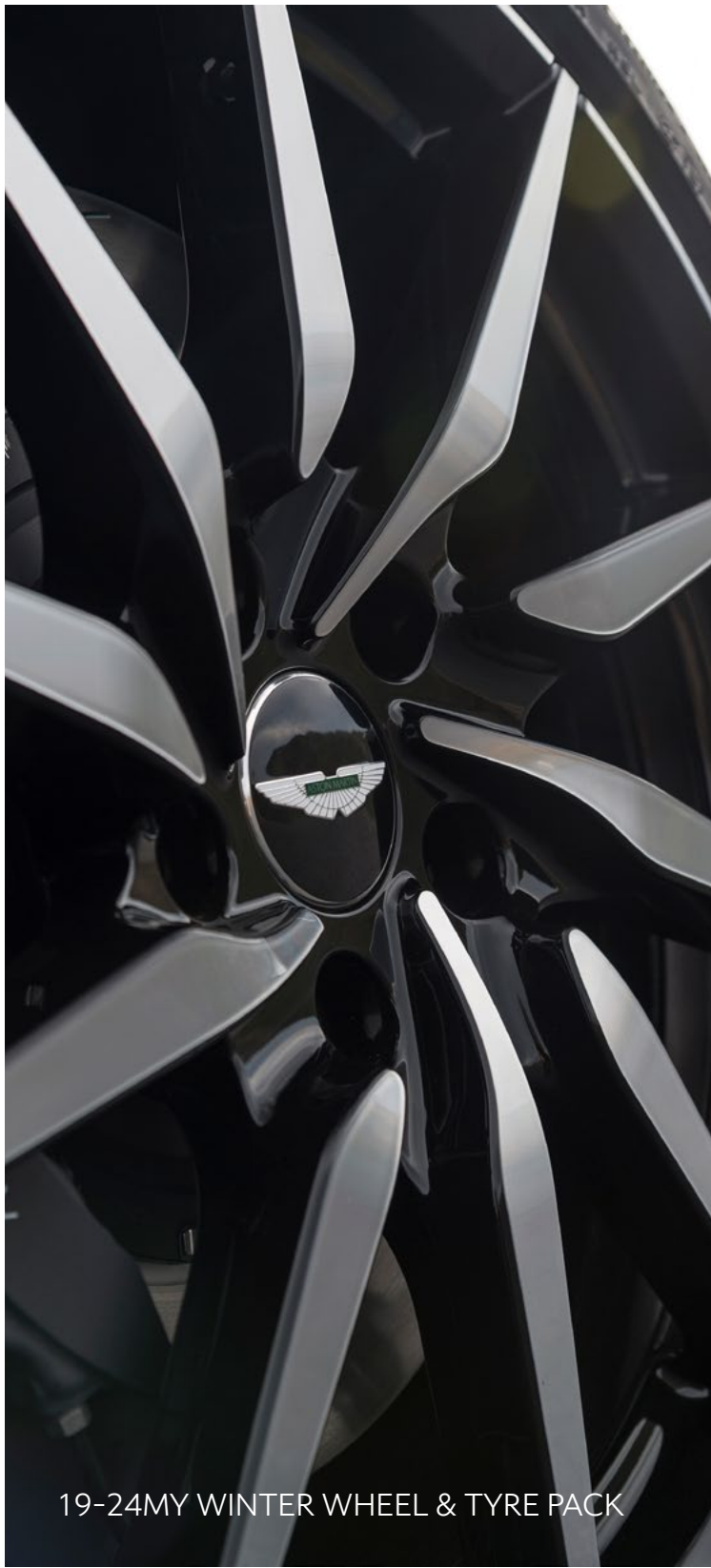
19-24MY WINTER WHEEL & TYRE PACK