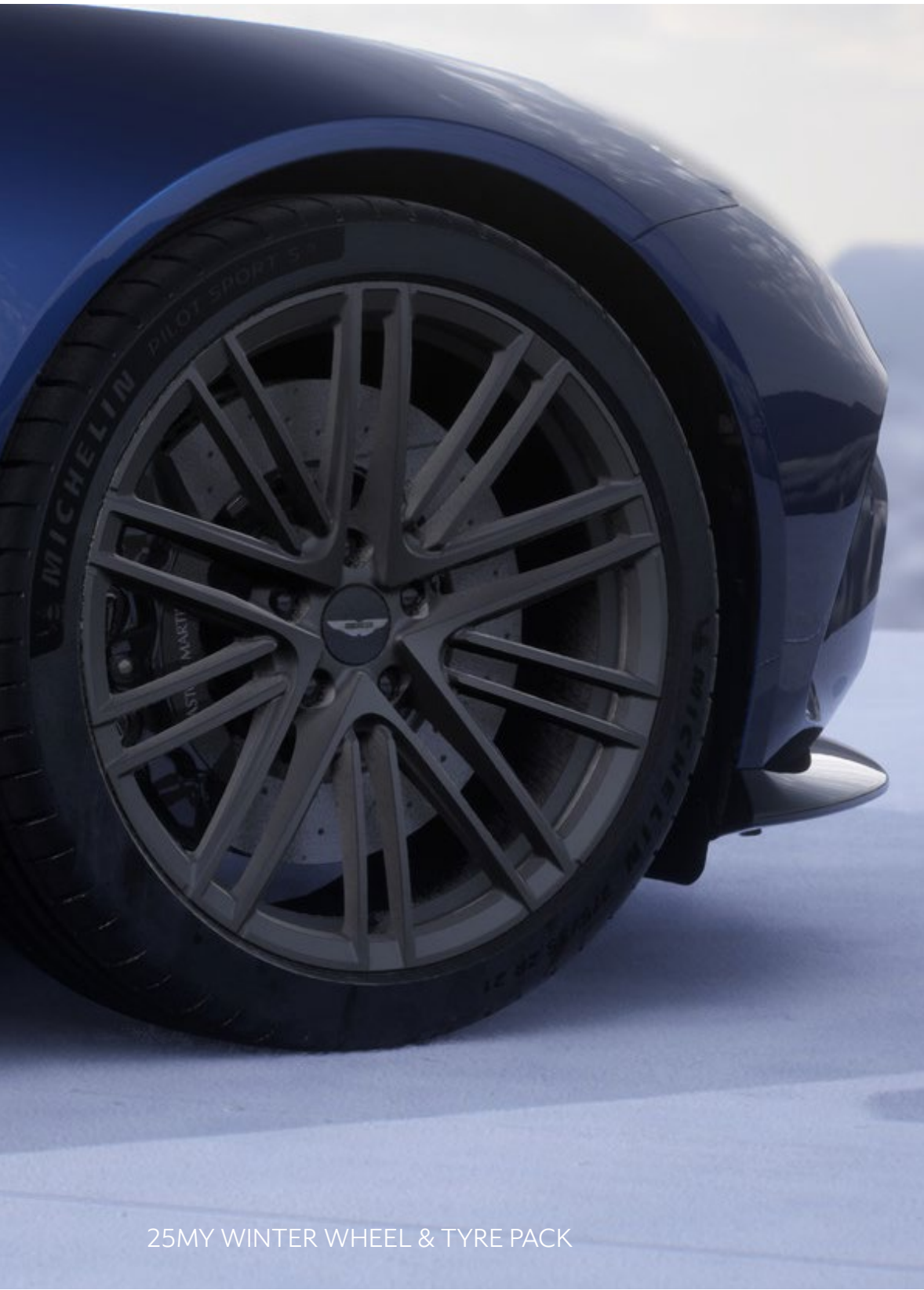
25MY WINTER WHEEL & TYRE PACK