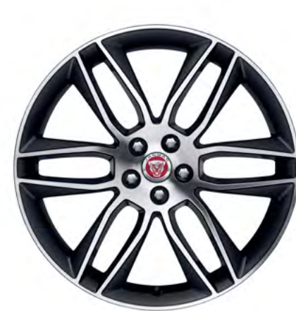
20" Style 6003, 6 split-spoke, Dark Grey Diamond Turned finish