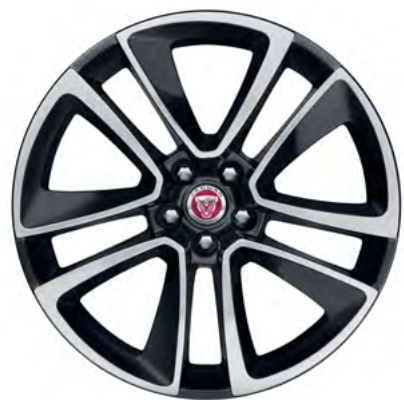
19" Style 5058, 5 split-spoke, Technical Grey Diamond Turned finish