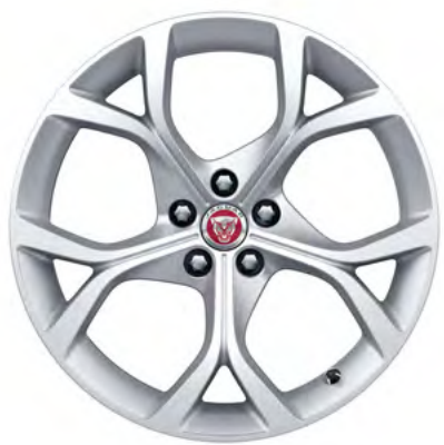
19" Style 5101, 5 split-spoke, Silver