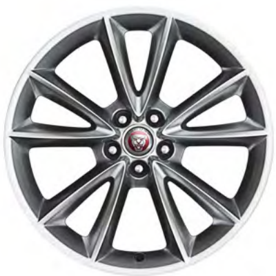
19" Style 5057, 5 split-spoke