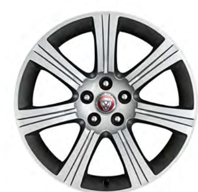
18" Style 7017, 7 spoke