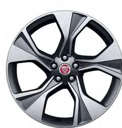
20" Style 5102, 5 spoke, Technical Grey Diamond Turned finish