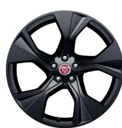
20" Style 5102, 5 spoke, Gloss Black