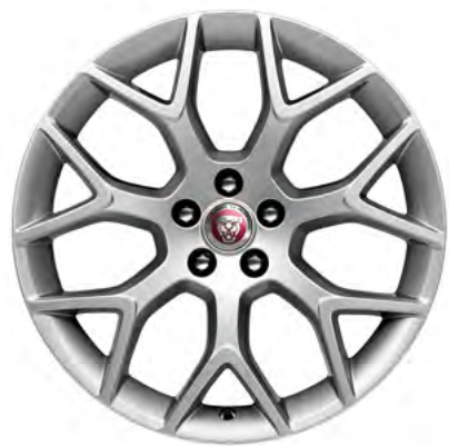
19" Style 7013, 7 split-spoke