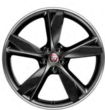
20" Style 5042, 5 spoke, Forged, Carbon Fibre and Satin Dark Grey Diamond Turned finish