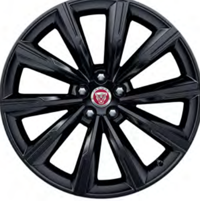
20" Style 1066, 10 spoke, Gloss Black