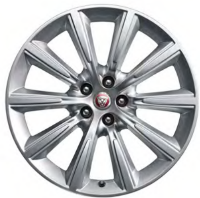
19" Style 1026, 10 spoke