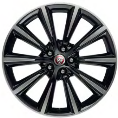
19" Style 1026, 10 spoke, Gloss Black Diamond Turned finish