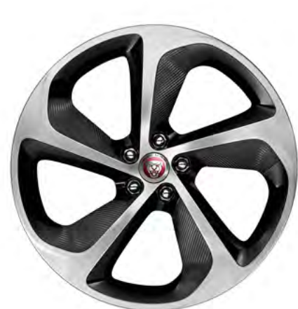
20" Style 5062, Forged, 5 spoke