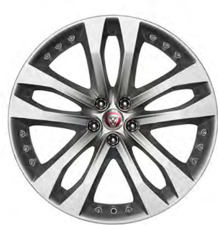
20" Style 5039, 5 split-spoke