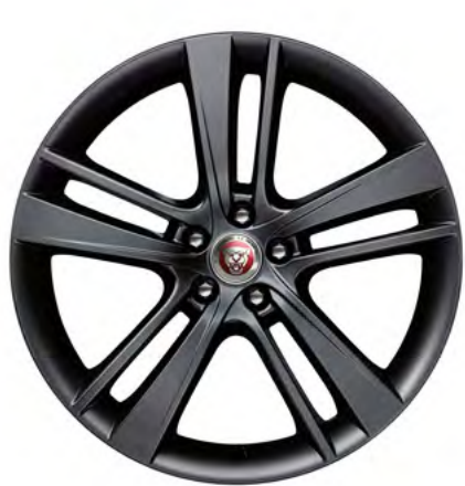
20" Style 5041, 5 split-spoke, Gloss Black