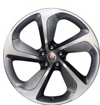
20" Style 5062, Forged, 5 spoke, Carbon Fibre Silver Weave