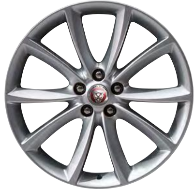
19" Style 1023, 10 spoke