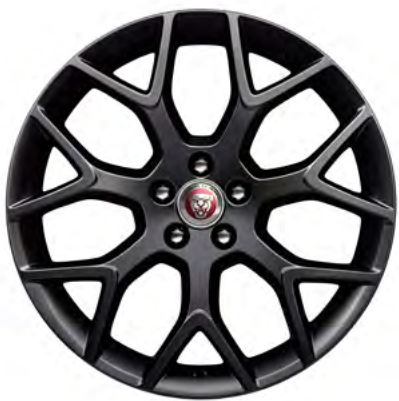
19" Style 7013, 7 split-spoke, Black