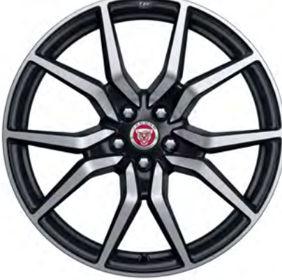
20" Style 1041, 10 spoke, Forged, Satin Black Diamond Turned finish