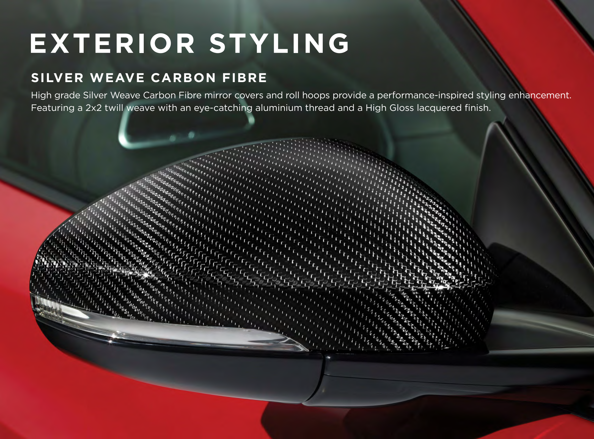
Silver Weave Carbon Fibre Mirror Covers

High grade Silver Weave Carbon Fibre mirror covers and roll hoops provide a performance-inspired styling enhancement. Featuring a 2x2 twill weave with an eye-catching aluminium thread and a High Gloss lacquered finish.