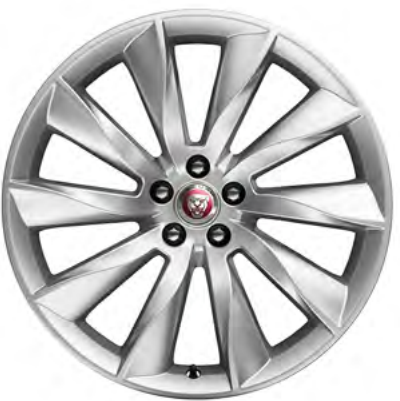
20" Style 1025, 10 spoke