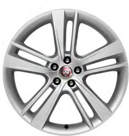
20" Style 5041, 5 split-spoke