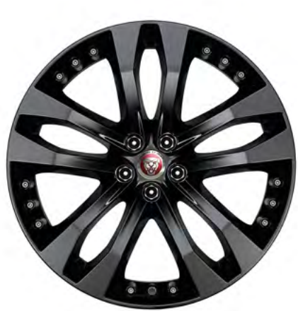
20" Style 5039, 5 split-spoke, Gloss Black