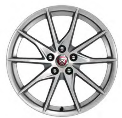
18" Style 1036, 10 spoke