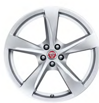
20" Style 5060, 5 spoke