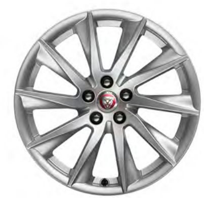
18" Style 1024, 10 spoke