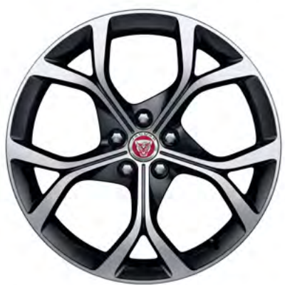
19" Style 5101, 5 split-spoke, Gloss Black Diamond Turned finish