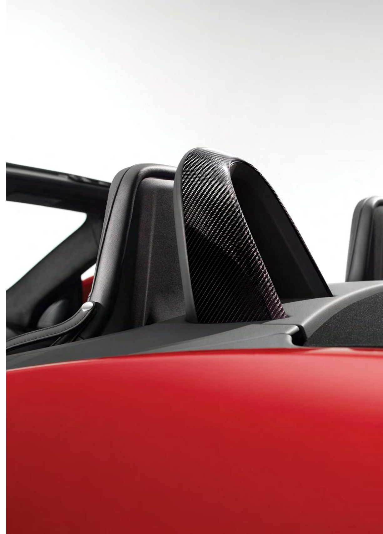
Silver Weave Carbon Fibre Roll Hoops