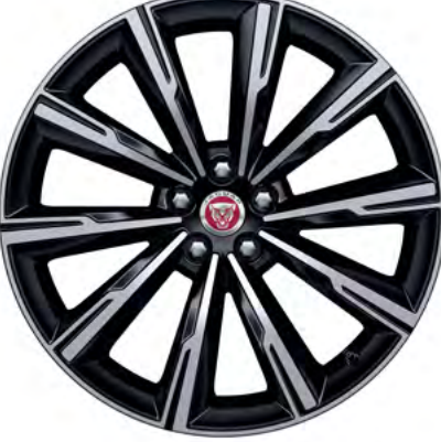
20" Style 1066, 10 spoke, Gloss Black Diamond Turned finish