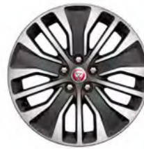
19" Style 5055, 5 split-spoke, Dark Grey Diamond Turned finish