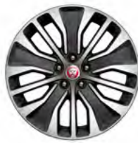
18" Style 5055, 5 split-spoke, Dark Grey Diamond Turned finish