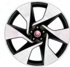
20" Style 6007, 6 spoke, Dark Grey Diamond Turned finish