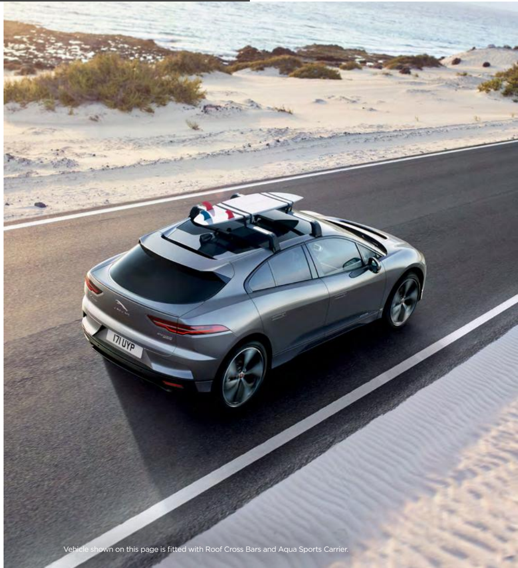
Vehicle shown on this page is fitted with Roof Cross Bars and Aqua Sports Carrier.