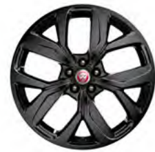
20" Style 5068, 5 spoke, Gloss Black