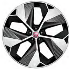
22" Style 5069, 5 spoke, Technical Grey with Carbon Fibre inserts