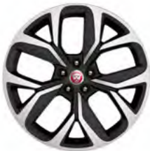
20" Style 5068, 5 spoke, Dark Grey Diamond Turned finish