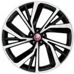
22" Style 5056, 5 split-spoke, Dark Grey Diamond Turned finish