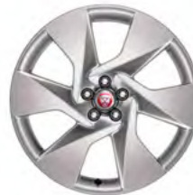
20" Style 6007, 6 spoke, Sparkle Silver