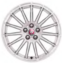
18" Style 1022, 15 spoke, Sparkle Silver

Personalise your vehicle with a selection of alloy wheels featuring a wide range of contemporary and dynamic designs.