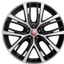
20" Style 5070, 5 split-spoke, Technical Grey Diamond Turned finish