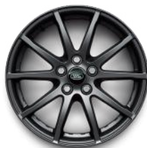
17" 10 Spoke, 'Style 1005' with Satin Dark Grey Finish