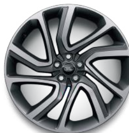
21" 5 Spoke, 'Style 5090' with Diamond Turned Finish