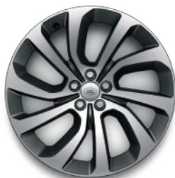
20" 5 Split-Spoke, 'Style 5089' with Diamond Turned Finish