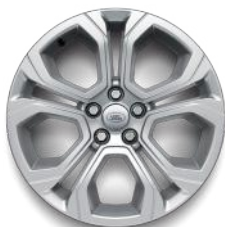
18" 5 Split-Spoke, 'Style 5075' with Gloss Sparkle Silver Finish