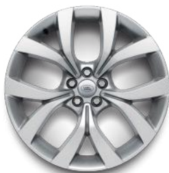
20" 5 Split-Spoke, 'Style 5076' with Gloss Sparkle Silver Finish