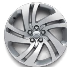
18" 5 Split-Spoke, 'Style 5074' with Gloss Sparkle Silver Finish