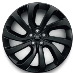
20" 5 Split-Spoke, 'Style 5089' with Gloss Black Finish