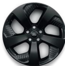
18" 5 Spoke, 'Style 5088' with Gloss Black Finish