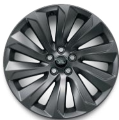
19" 10 Spoke, 'Style 1039' with Satin Dark Grey Finish