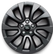
17" 5 Split-Spoke, 'Style 5073' with Satin Dark Grey Finish

Personalise your vehicle with a selection of alloy wheels featuring a wide range of contemporary and dynamic designs.