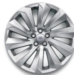
19" 10 Spoke, 'Style 1039' with Gloss Sparkle Silver Finish