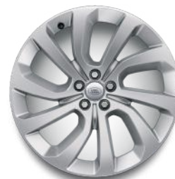
20" 5 Split-Spoke, 'Style 5089' with Silver Finish